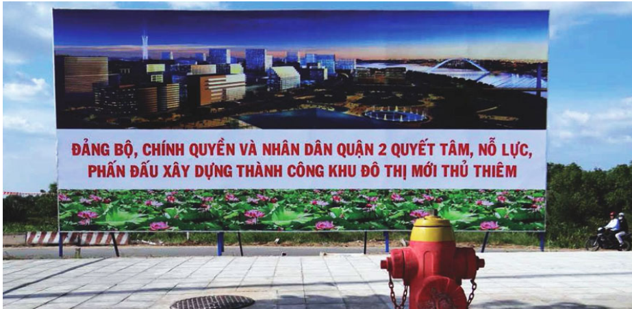
Vision for Thu Thiem (2011).

of the past two decades has been positive. The urban citizens have higher living standards and are provided with much better housing now. Urban poverty has been reduced significantly. The downside, however, is that traffic and the environmental pollution have undoubtedly increased.