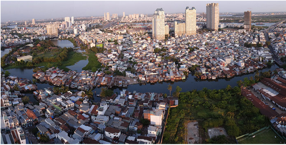
View from City Garden Apartment towers.

The most impressive sight from above was from City Garden apartments in Binh Thanh District. There, I got official permission from the property management board and was allowed to take photos from all of the three towers, accompanied by a security guard, of course. The view from there is simply amazing, you see both the endless maze of low-rise high-density urban fabric and the luxury high-rise towers of the Manor Saigon and Saigon Pearl. This striking contrast illustrates what academics call, “urban-spatial fragmentation”.